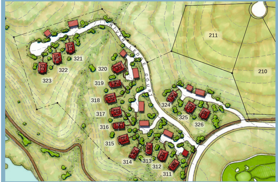
THE RESIDENCE CLUB